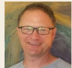
Jasper Kock Signage