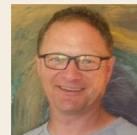
Jesper Kock Signage